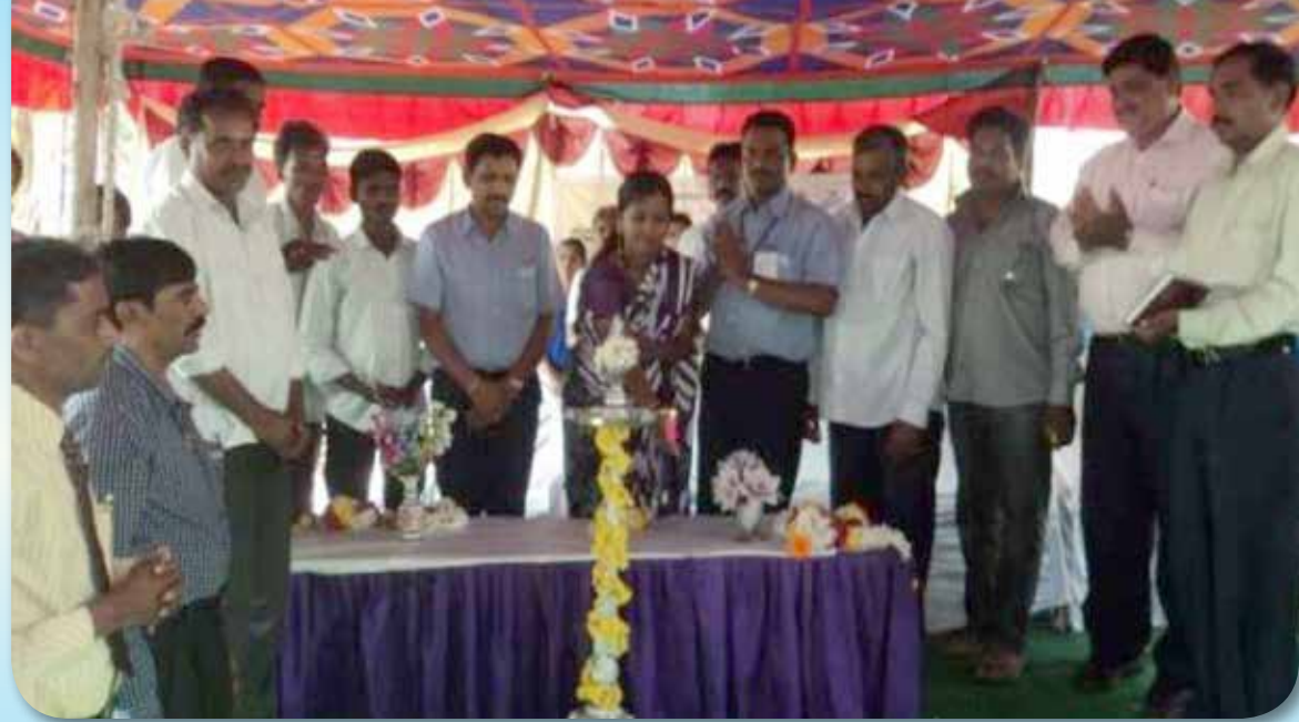
Lighting of the lamp by guests

Rajkiya Prathmik Vidyalaya a Government primary school near Jubilant Industries Ltd at Sahibabad caters to around 350 students. The school had unfurnished classrooms, wrecked toilets and concrete surroundings. The school premise in all together gave a very desolate look. Jubilant Bhartia Foundation stepped in to giving school a makeover and making it a child friendly school under its luminary project Muskaan. With the infrastructure support from JBF the school now have new and clean toilets, green ambience, utensils for Mid Day Meal and a furnished class room. JBF donated benches to the students from classes 6 th to 8 th in the year 2012-13. This year it donated the benches to the students of classes 4 th & 5 th . Till now they use to sit on the floor.