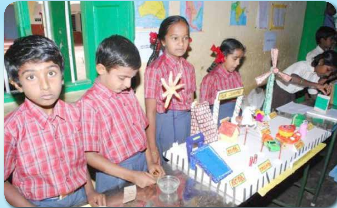
Science Exhibition in progress