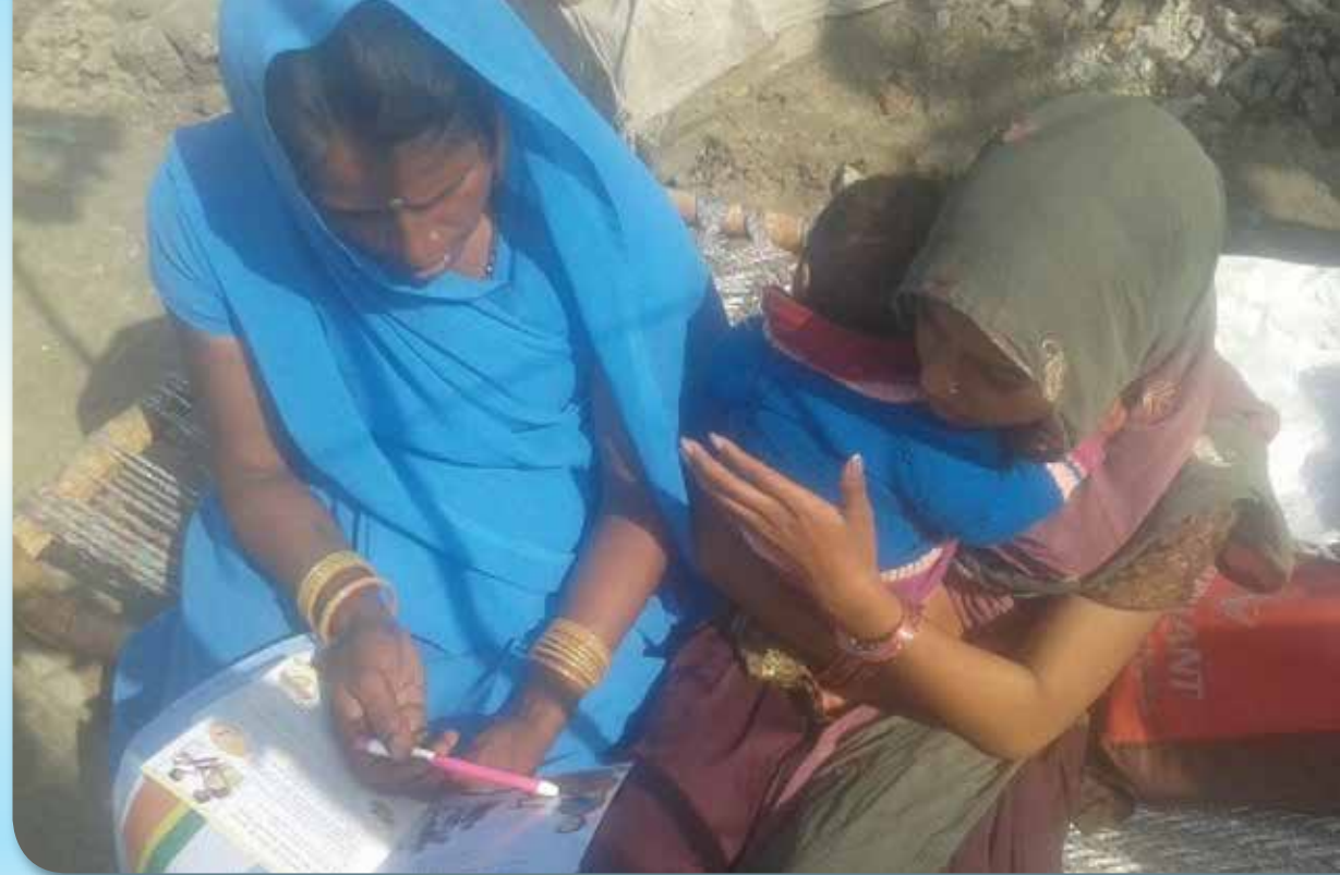
Health guard with a new mother

The baseline data for 11 pilot villages in Gajraula including 2546 children has been taken and analysis of the same is in process. Some facts below