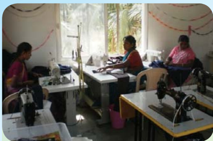
Women engrossed in work at Nanjangud stitching Centre