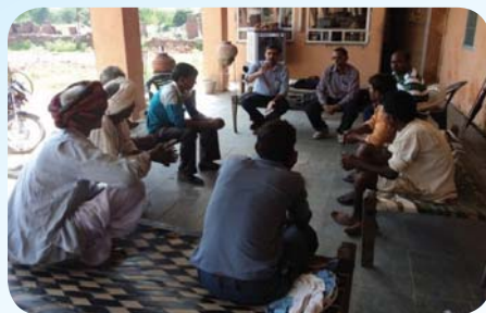
Meeting of farmers and field visit with ISAP and Monsanto scientist under Samriddhi project