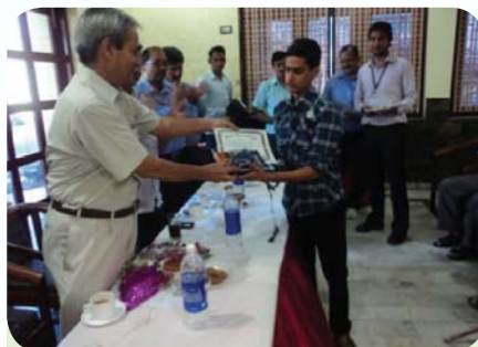
Pratibha Puskaar Ceremony at Gajraula in progress