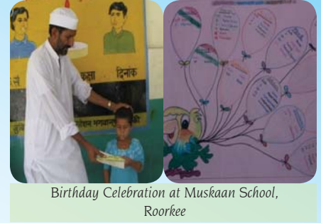
Birthday Celebration at Muskaan School, Roorkee