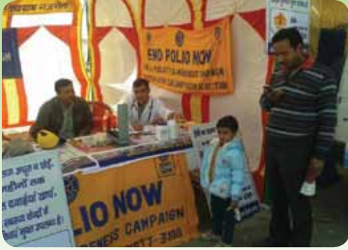
Polio Awareness campaign during Tigri Mela , Gajraula