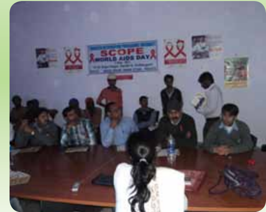
Activities during world AIDS day