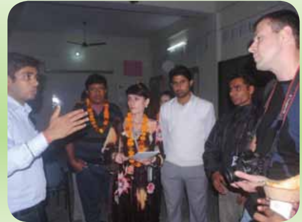
Delegates at the Vocational Centre at Gajraula