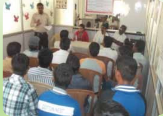
Training program at Nanjangud