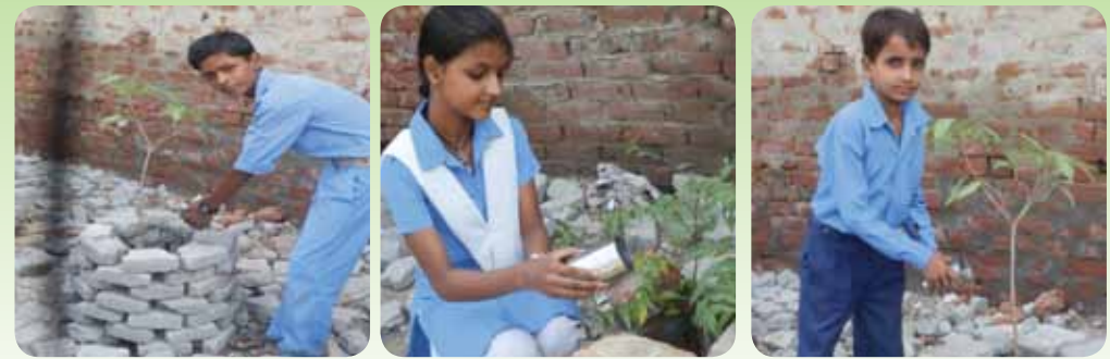
Plantation by Muskaan Students at Sahibabad

Polio programme was organized at Gajraula by Jubilant Bhartia Foundation in association with