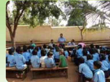
Awareness session on safe Diwali in progress

Rotary Club where JBF volunteers go to different public places like Bus Stand, Railways station, major public places as well as booths in villages and help in immunization through oral Polio Vaccine to the child. The occasion of Tigri Mela which receives the footfall of 7 to 8 Lacs at Gajraula was utilized for the awareness programme. Most of the community members from and outside Gajraula block came along with their families thus giving ample scope for mass awareness.