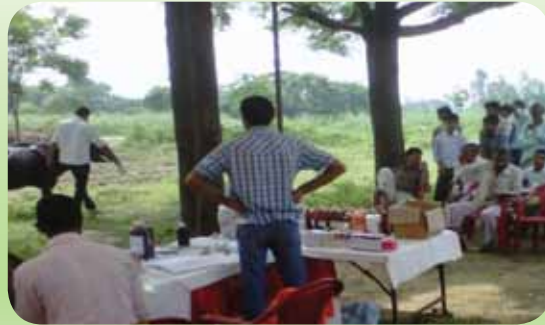
Cattle care camp in progress

Gajraula is an agrarian place where farmers ranging from large scale to marginal farmers are working to give a boost to Indian economy and the resident of Village - Bhikanpur Sumali are also farmers with a lot of cattle to support the same. In the same context we received a request from Gram Pradhan (Village Head) for a cattle health check-up camp as the animals are prone to ailments and diseases in the rainy month in this part of India. In response to their request Jubilant Bhartia Foundation organized a camp jointly with Block Veterinary Department where team of Veterinary Department examined the animals of Bhikanpur village. People came with their cattle and explained the problems with veterinary doctor and got their cattle with check-up as well as medicines for free. The team also briefed the villagers about common problems, their symptoms along with their remedies. The doctors also provided the