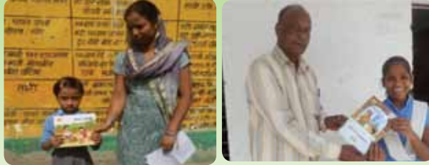
Birthday Celebrations at Muskaan School in Sahibabad

The employees at Jubilant also support Birthday Celebration activity through 'Joy of reading' Program. The volunteer employees have donated new books, purchased under this program, as a birthday gift to Muskaan students. On receiving the present on their birthday, the Muskaan school student sends a "Thank you card" to the employee who has gifted the book. The program provides an opportunity to its employees to participate in nation building activity by supporting education in a way. The birthdays of the students of the Sahibabad Muskaan School is also celebrated by gifting a book every month. In return they sent the thank you cards to the employees of Jubilant.