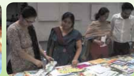
Joy of Reading Program: Book Exhibition for Employees