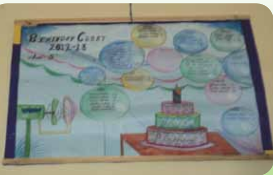
Birthday Celebrations at Muskaan Schools

The employees at Jubilant also support Birthday Celebration activity through 'Joy of reading' Program. The volunteer employees have donated new books, purchased under this program, as a birthday gift to Muskaan students. On receiving the present on their birthday, the Muskaan school student sends a "Thank you card" to the employee who has gifted the book. The program provides an opportunity to its employees to participate in nation building activity by supporting education in a way.