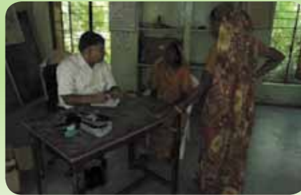
Health Camp at Paswa at Samlaya

Inmates of Paswa village at Samlaya were hit by Chikengunia disease. A one day health camp was organized in the village. The health physician from JBF looked for the severity of the disease amongst the patient and provided referral services. Information on preventive measures was also provided. Nearly 100 patients were attended at the health camp.