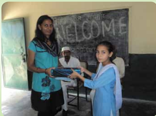
Teachers Day celebration

Teachers play very important role for student's education. They are the pivotal in making the Project Muskaan a success. On 5th Sep 2012, JBF organized teachers' day celebration at all Muskaan schools at the respective locations. Various cultural programme has been performed by the students. The teachers were also felicitated by JBF.