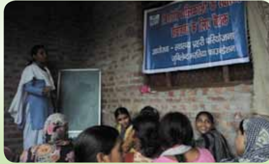
Awareness programme for adolescent girl.

It was observed that adolescent girls don't have knowledge regarding vaccination, sanitary pad, folic acid tablets etc. So, JBF at Roorkee have organized meeting with age group between 13 to 19 years. A discussion regarding adolescent reproductive health was carried out in the meeting.