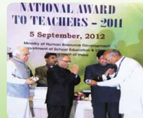
Cheering up for the teacher who received coveted National Award