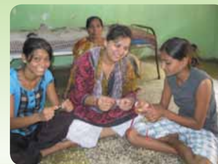
Rakhi making Training in progress