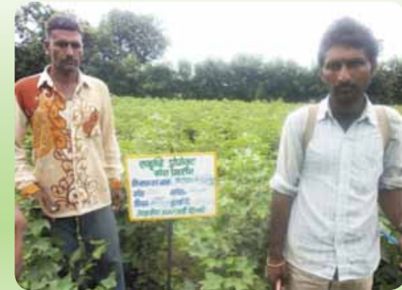
Training of Farmer's through Plot Demonstarion under project Samriddhi