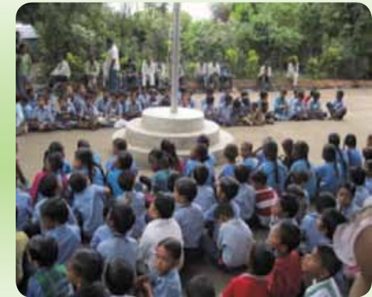
Celebration of Independence Day at all Muskaan Schools