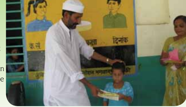
Birthday celebration of a Muskaan Student

The Muskaan students are made to feel special on their birthday at school by JBF. The birthday boy/girl is presented a card and a small gift by JBF in front of whole class and teachers. The aim is to sustain the interest of students in coming to school and thus increasing the rate of attendance. The next quarter would highlight the Jubilant employees' effort in celebrating the birthday of these students.