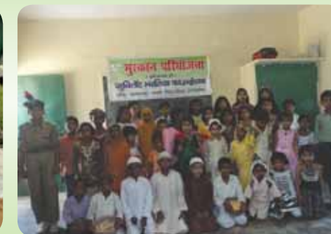
Summer Camp in progress