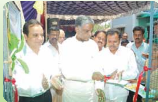
Inauguration ceremony of drinking water system at Nanjangud