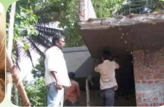
Onsite training at Nanjangud