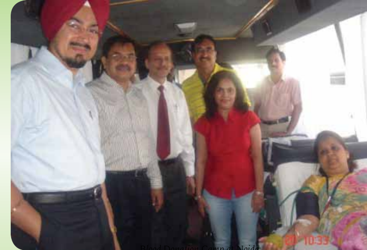
Blood Donation Camp at Noida

In association Red Cross Society JBF organized a blood donation camp at corporate office on 20th June 2012. 71units of blood was donated for a noble cause by the employees at Jubilant.