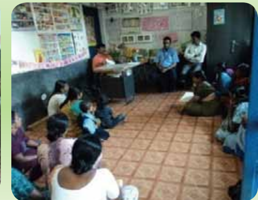
Health awareness session at Nanjangud in progress