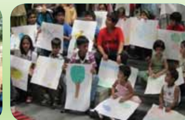
Celebration of World Environment day at all Muskaan schools along with corporate office